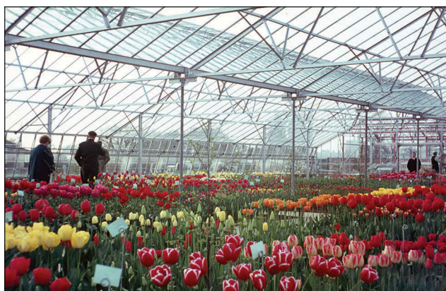
Figure 4. Tulips in a high-tech commercial greenhouse.

This review is mainly concerned with sophisticated, expensive, permanent greenhouses that currently require considerable heating as they are located in north-temperate areas and are operated year-round. Large areas of high-technology greenhouses are in Europe (especially the Netherlands) and in North America. Horticultural crops commonly grown in such greenhouses include culinary herbs, leafy edible greens, ornamentals (cut flowers and potted plants; Figure 4 ), peppers ( Capsicum species), strawberries, and tomatoes. ‘Nursery stock’ (seedlings and young plants) for outdoor ornamental planting and tree seedlings for forestation are also commonly established in greenhouses, especially in late winter and early spring. Some pharmaceuticals (especially vaccines) produced in genetically modified plants are now being produced indoors because this halves the time of conventional production. Cannabis has recently been added to this list of greenhouse plants, and indeed many advanced commercial greenhouses growing other crops are being converted to produce marijuana (Mesly 2018 ).