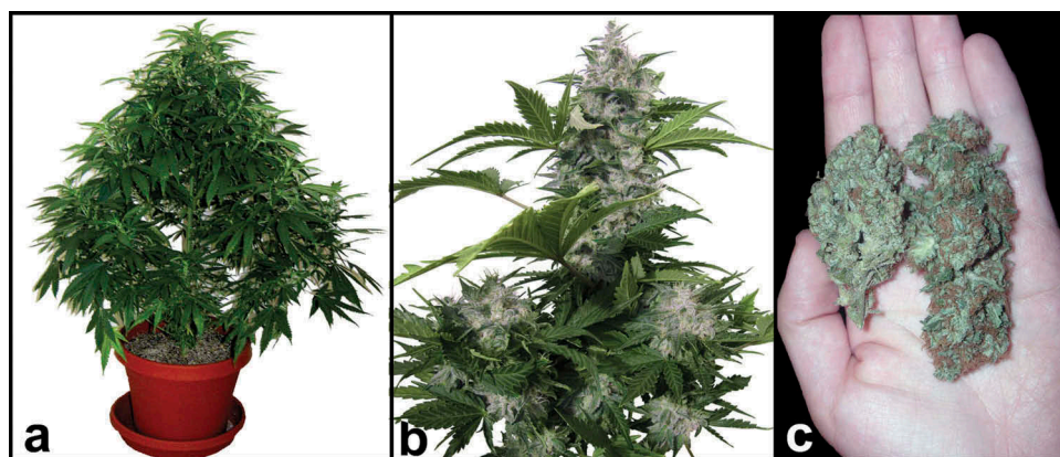
Figure 2. Marijuana plants and the principal harvested product, ‘buds’ (female inflorescences, i.e. compact clusters of flowers). (a) Vegetative plant. (b) Flowering top of a female plant (the white stigmas of the flowers are evident). (c) Dried buds.

Marijuana drugs are preparations with the inebriating chemical THC, which is synthesised in tiny