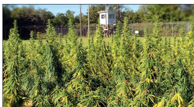
Figure 17. Field cultivation of marijuana at the U.S. Government production site, University of Mississippi, Oxford.

allowing this unnecessary practice is the need for extreme security as perceived by governmental regulators. However, this is a holdover from a century of fear of narcotic drugs and confusion about appropriate management strategies. Curiously, the world's most