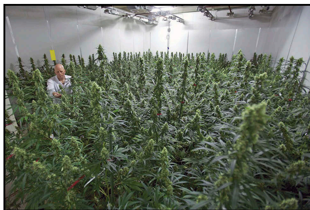
Figure 8. Medicinal marijuana production by Bedrocan, the sole authorised national supplier of medical marijuana to the Netherlands government since 2001. This growth room employs only artificial light.

With artificial light, plants can be produced without the benefit of natural sunlight, and indeed researchers commonly employ sunless relatively small ‘growth chambers’ in which plants are grown (at considerable cost) in a rigidly controlled and monitored climate. Glass houses or at least transparent roofs take advantage of natural sunlight, but frequently marijuana ‘grow rooms’ are completely artificially illuminated. Commercially, so-called ‘plant factories’ are artificially illuminated and highly insulated closed growth systems which are usually very large and located near sources of cheap electricity.