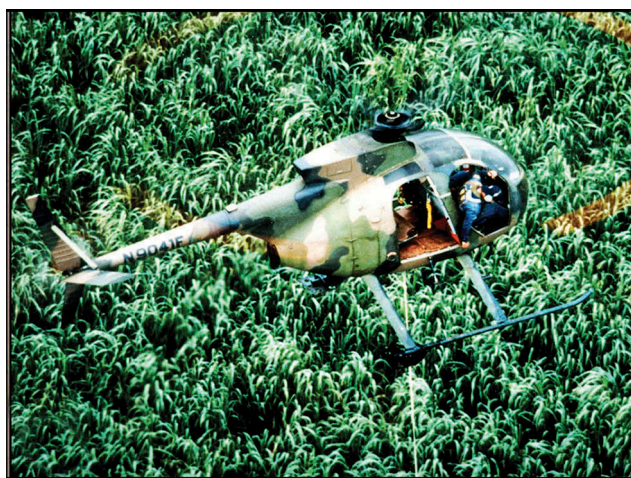
Figure 7. Helicopter spraying of Paraquat herbicide on a field in which marijuana plants are hidden among legally grown crops.

An additional negative result of the widespread clandestine cultivation of marijuana is that it stimulates law-enforcement personnel to use chemical eradication at extremely toxic levels so as to ensure that there are no surviving plants (although herbicides are often of limited effectiveness for plants taller than about 60 cm). Law enforcement in some countries has employed paraquat herbicide to control illicit marijuana cultivation, notably in Mexico (Figure 7).