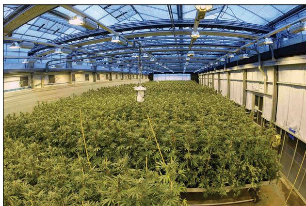
Figure 9. One of the growth facilities of GW Pharmaceuticals (U.K.), using a combination of natural and artificial lighting, each providing about half of the light energy required (Potter 2014).

The expression ‘hybrid greenhouse’ refers to a building, intended to grow plants, with solid side walls and a translucent ceiling (Figure 9). Certainly, unauthorised entry is much more difficult than in greenhouses made almost entirely of glass. An additional benefit is that the crop is hidden from public view, reducing temptation. And, the opaque side walls can be very heavily insulated to reduce heat loss. Hybrid greenhouses, with metal walls, and glass or plastic roofs, have become very popular for marijuana businesses. Of course, the benefits are at the cost of reduced natural light entry and the need to supply supplementary artificial lighting.