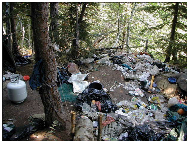
Figure 6. Garbage and debris left at a marijuana grow site in the Shasta-Trinity National Forest in California.

In North America, illicit outdoor operations are frequently carried out in plots hidden in forested areas. Using public lands is motivated in part by the threat of forfeiting assets that are present when using personal residences for production. Those who establish marijuana gardens and visit them only to maintain and harvest the plants have been called 'guerrilla growers'. The illegal cultivation of cannabis in preserved wildlands is extremely deleterious to biodiversity and its supporting habitats (United States Senate Committee on Agriculture, Nutrition, and Forestry 1988; Montford and Small 1999a, 1999b; Mallery 2011; Miller 2018). Illicit marijuana producers usually have little respect for delicate ecosystems. Garbage is dumped in national parks (Figure 6), and groundwater and creeks are contaminated with pesticides, herbicides and spilled fuel carried to the sites to run diesel generators. Diesel production of electricity produces considerably more greenhouse gases than the relatively low-carbon electricity used conventionally ('diesel dope' is a pejorative phrase descriptive of marijuana produced using diesel energy). In California, rodenticides are often used to prevent small mammals from destroying illegal marijuana plants. Rats consume the poison, and then Northern Spotted Owls, Fishers, Foxes and Bobcats