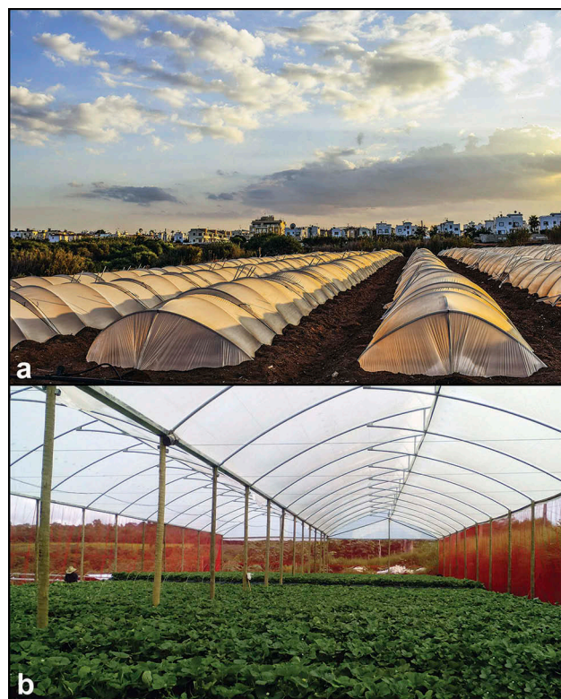
Figure 3. Examples of low-tech greenhouses that require virtually no energy expenditures. (a) Low-tunnel greenhouses. (b) A huge but simple greenhouse growing strawberries.

agriculture are simple, more or less temporary tent-like or Quonset-like structures often referred to as 'tunnels'. 'Low tunnels' are typically semi-circular and less than 1.2 m high (Figure 3(a)), and to access the plants inside requires temporarily moving part of