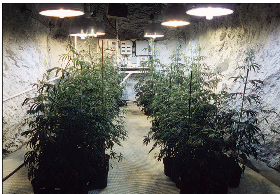
Figure 14. Marijuana ( Cannabis sativa ) growing in a mine shaft tunnel for the Canadian medical marijuana program. Growth underground greatly reduces costs of heating, but requires artificial lighting.

Indoor production of marijuana is also associated with the production of carbon dioxide, which acts as a greenhouse gas contributing to climate change. Much of the electrical energy utilised results in CO 2 production, and often fuels are burned directly in support of greenhouse operations, releasing