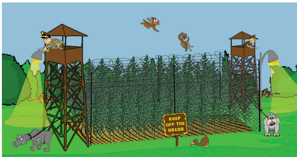
Figure 11. High security barriers typically required for field cultivation of marijuana. Prepared by B. Brookes.

to prevent unauthorised entry. Of course, this has added considerably to costs, which have simply been passed on to patients. With recreational marijuana rapidly being added to the marketplace, the price factor is becoming more pressing. Indoor cultivation greatly adds to the expense of production, but is much more secure. The need for such security is examined later.