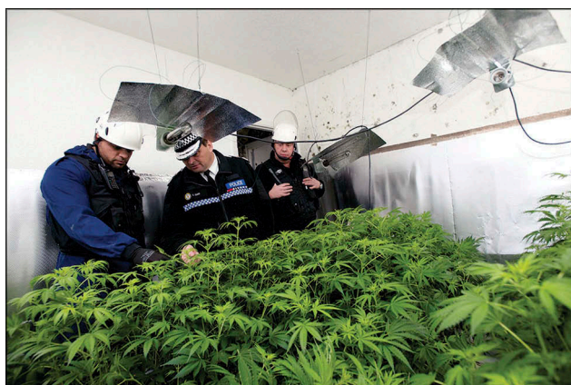
Figure 5. Police in England raiding an illegal sunless grow-op in a house.

Illegal sunless indoor 'grow-ops' (grow operations, also called 'cannabis factories' in the United Kingdom and 'marijuana factories' in the U.S.) are frequently located in residences modified to produce marijuana (Figure 5). Considerable stolen electricity is used to power lighting, ventilation, and irrigation systems. Irresponsible and incompetent power and fuel installations have resulted in electrical shorts and house fires. Excessive moisture frequently has generated very high humidity, encouraging fungi that rot timber framing, deteriorate walls, and generate very high densities of spores that threaten human health. Amateur preparation of solvent extracts of THC by butane extraction has produced explosions (Healy 2015). Rebuilding