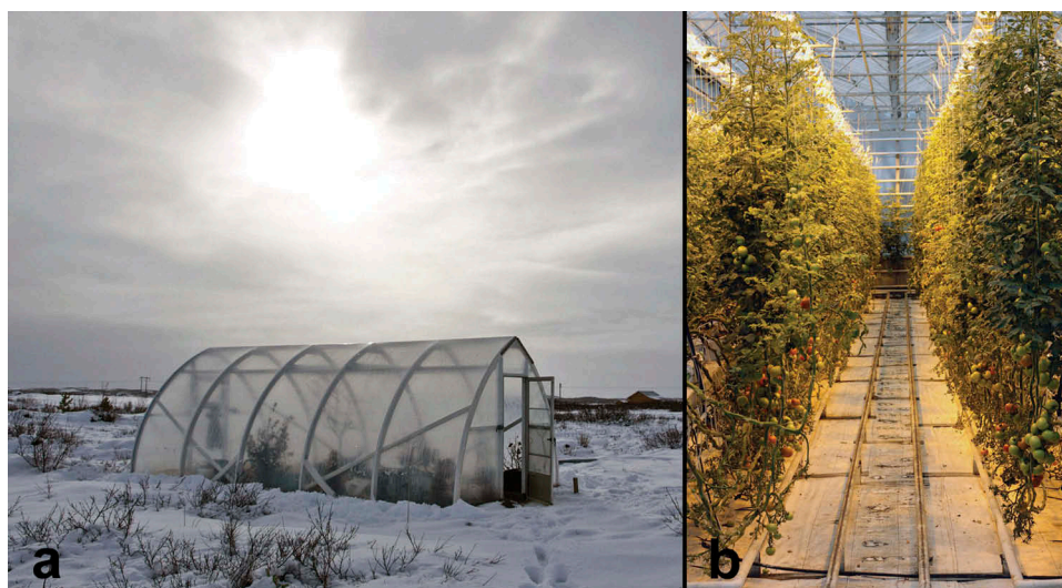
Figure 15. Geothermally heated greenhouses in Iceland. (a) A simple polyethylene greenhouse, taking advantage of the naturally warmed soil to considerably extend the growing season. (b) Tomatoes growing in a greenhouse heated by geothermally warmed water.

CO 2 . Mills (2012) calculated that 1 kg of marijuana produced indoors is associated with the release of 4600 kg of CO 2 emission to the atmosphere, equivalent to operating 3 million cars for a year. Occasionally, CO 2 is injected into grow rooms to increase photosynthesis and yields, and this also contributes to atmospheric pollution. However, since productivity is increased, the overall carbon footprint of introducing CO 2 may actually decrease negative environmental impacts (O'Hare, Sanchez, and Alstone 2013).