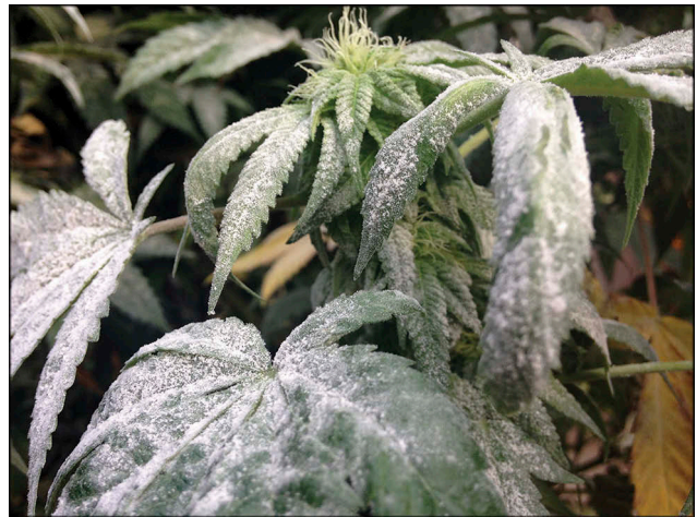
Figure 13. Powdery mildew ( Golovinomyces cichoracearum = Erysiphe cichoracearum ) on marijuana plants (Bubba Kush strain) growing in a commercial medicinal cannabis production greenhouse.

Experienced expert cooks can produce uniformly perfect dishes with nearly 100% fidelity. Experienced expert horticulturalists and farmers cannot always produce perfect crops because Mother Nature deviously furnishes bacteria, fungi, insects, and other forms of biodiversity that sometimes overcome even the best defences of humans. An attack by a pest can easily ruin a greenhouse or a field of material. Several pests are specialists of greenhouses, and in the case of cannabis, spider mites are extremely common (Figure 12). Powdery mildews are also a constant threat (Figure 13). For most commercial crops, there are more serious pests outdoors than indoors. Numerous crops cannot be grown efficiently outdoors without at least occasional application of biocides (particularly pesticides