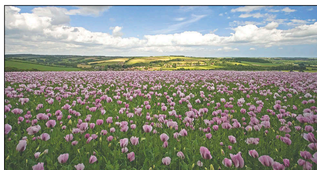
Figure 16. A field of Opium Poppies cultivated for pharmaceuticals in North Dorset, England.

This review has laid out in detail the pros and cons of cultivating marijuana in energy-wasting greenhouses. The criterion that has been most responsible for