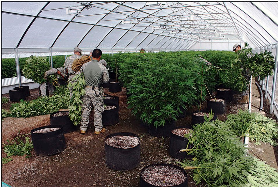
Figure 10. A simple unheated greenhouse employed to grow marijuana (illegally). The plants are being seized by the California Counterdrug Task Force.

Poet Robert Frost famously wrote ‘Good fences make good neighbours’. Fences for producing medicinal marijuana outdoors, where permitted, have typically been as well defended as top-secret military sites (Figure 11; compare Figure 17). In the main, to date, both regulators and licensed growers have been comfortable growing medical marijuana indoors, protected by very solid walls, as well as massive safes for storage, security personnel, guard dogs, motion detectors, video recording, and search lights